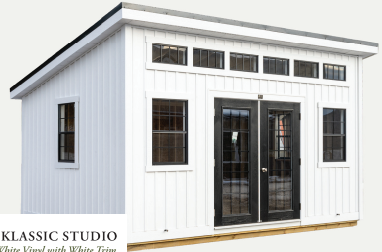
12'x16' KLASSIC STUDIO shown in White Vinyl with White Trim