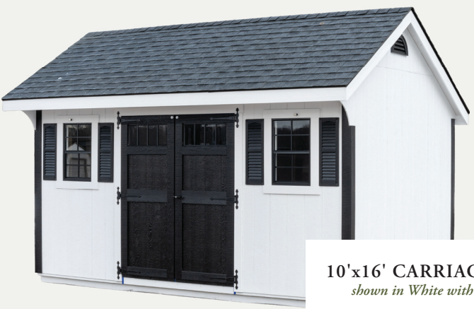
10'x16' CARRIAGE HOUSE shown in White with Black Trim

Upgrade to a Deluxe Package see page 20.