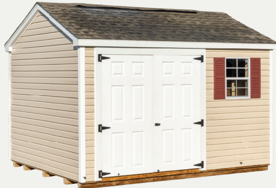
10'x12' COTTAGE WORKSHOP shown in Monterey Sand Vinyl with White Trim