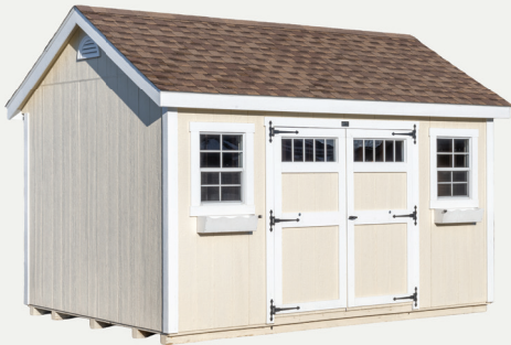
CAPE COD DELUXE