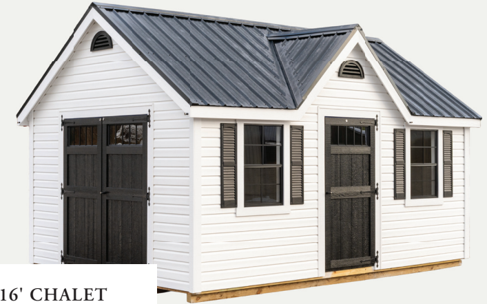
12'x16' CHALET shown in White with Black Trim