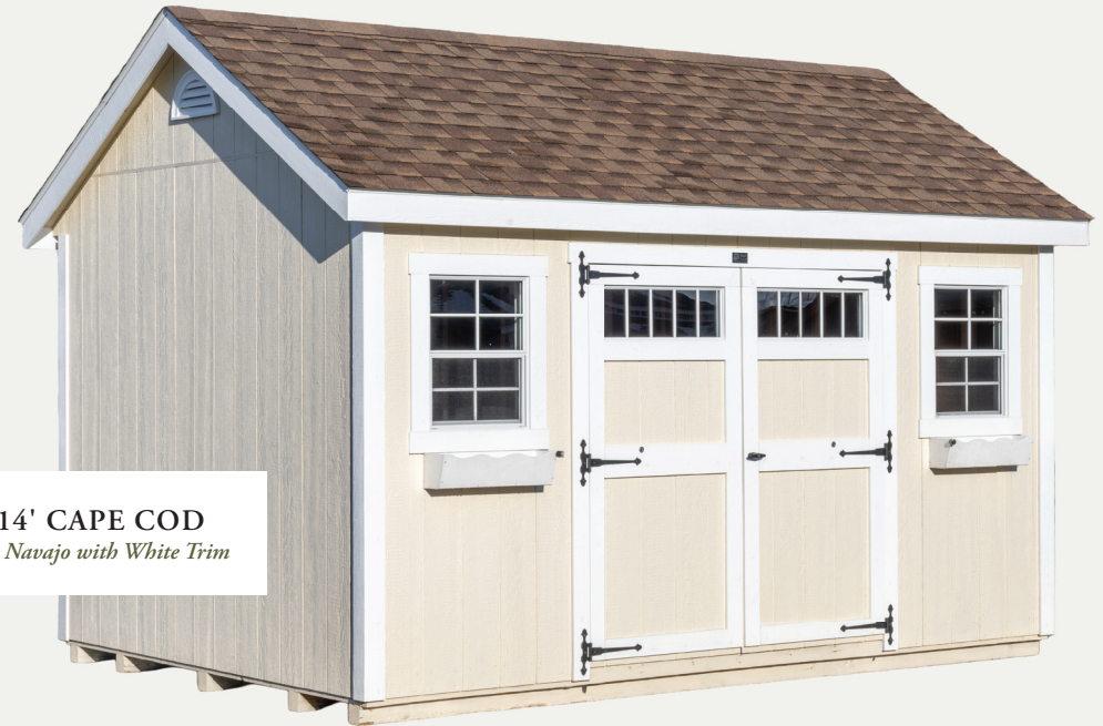
10'x14' CAPE COD shown in Navajo with White Trim