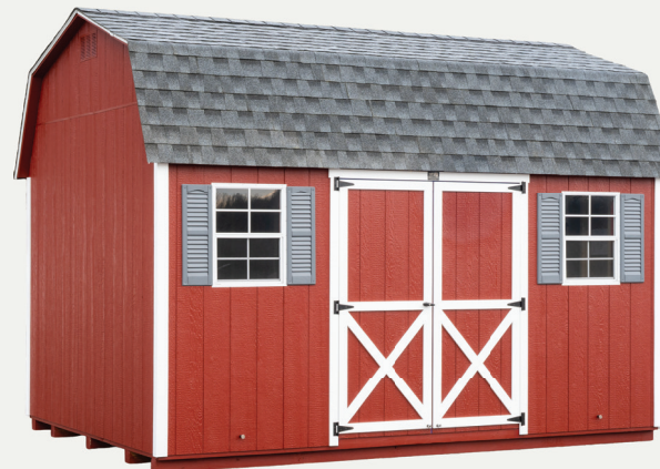
10'x14' DUTCH BARN shown in Stauffer Red with White Trim