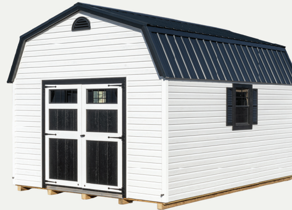
12'x16' DUTCH BARN shown in White Vinyl with Charcoal Smoke Trim

Upgrade to a Deluxe Package see page 20.