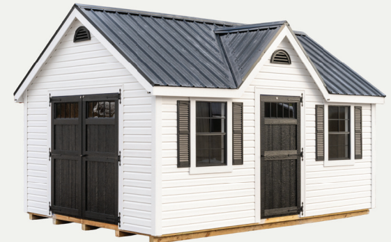
VINYL CHALET DELUXE