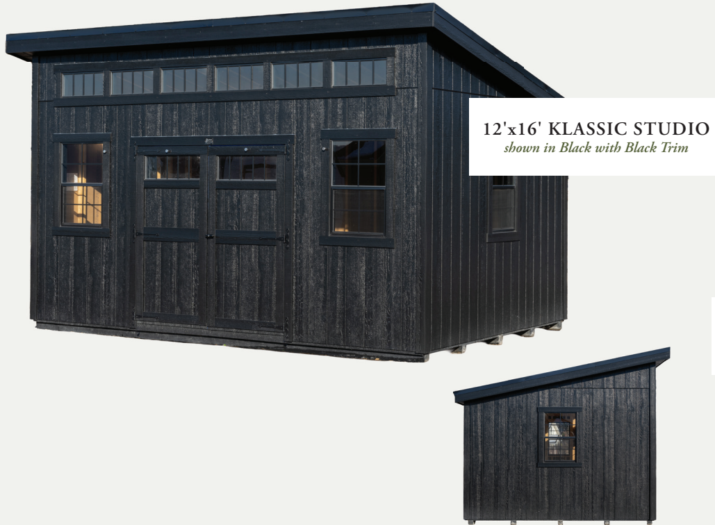
12'x16' KLASSIC STUDIO shown in Black with Black Trim