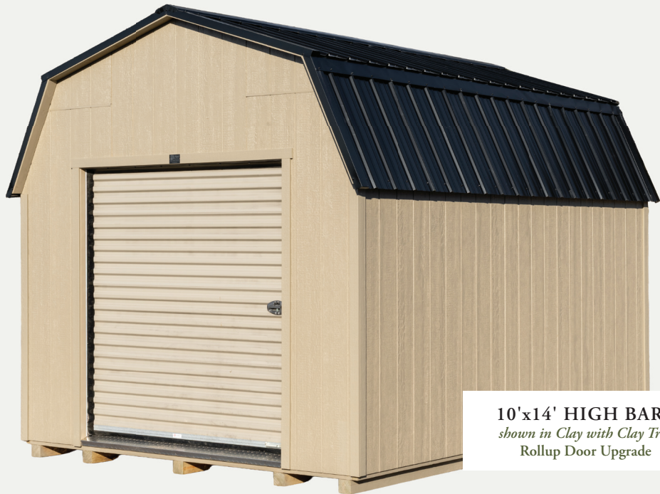
10'x14' HIGH BARN shown in Clay with Clay Trim Rollup Door Upgrade