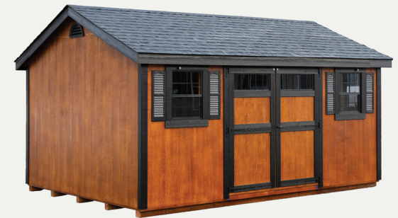
COTTAGE WORKSHOP DELUXE