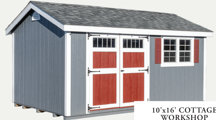
10'x16' COTTAGE WORKSHOP shown in Dawn Grey with White Trim