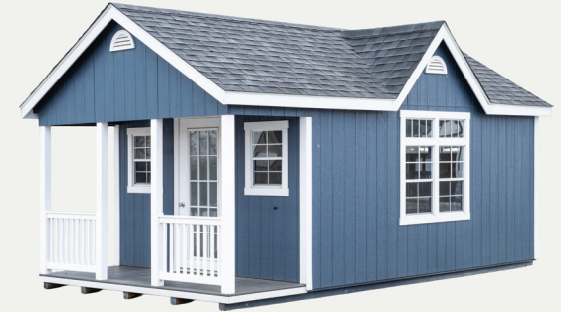
CAPE COD DELUXE