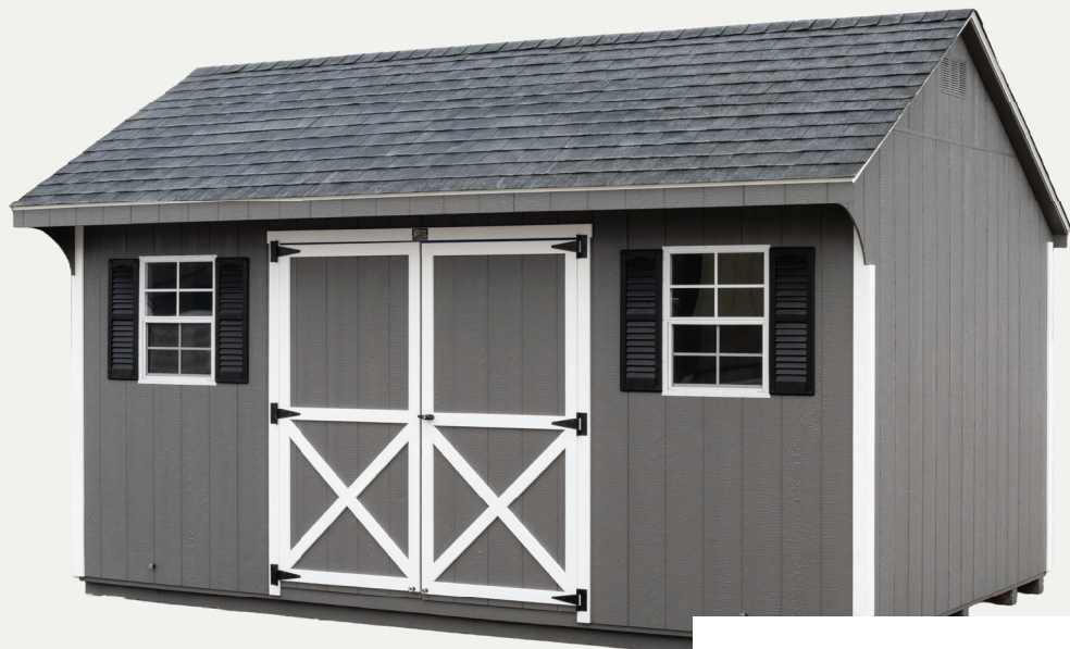
10'x16' CARRIAGE HOUSE shown in Charcoal Grey with White Trim