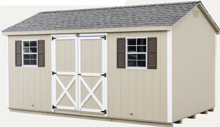
10'x16' COTTAGE WORKSHOP shown in Sandstone with White Trim

Upgrade to a Deluxe Package see page 20.