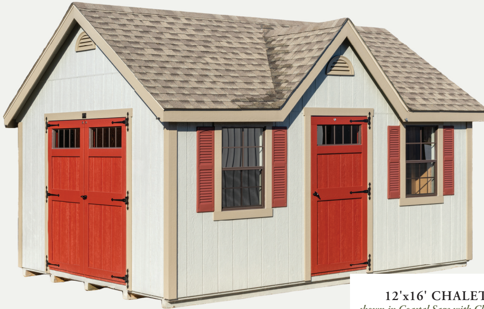
12'x16' CHALET shown in Coastal Sage with Clay Trim

Upgrade to a Deluxe Package see page 20.