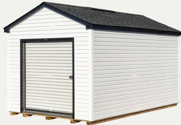
10'x16' COTTAGE shown in White Vinyl with Black Trim